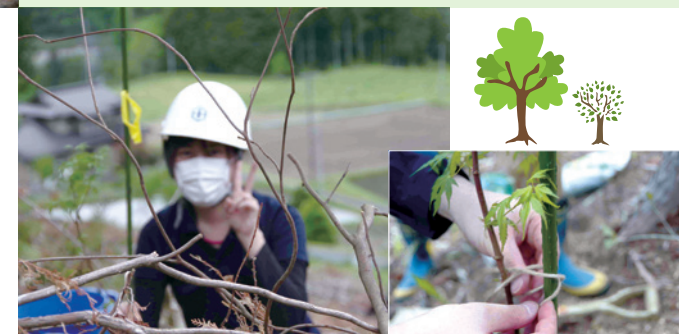
North Ena forest weeding, Kamitase area

The Foundation is engaged in the development of a "satoyama environment" in the mountains and forests surrounding the Tsukechi district of Nakatsugawa City by converting the trees to a broadleaf forest and other measures, as well as implementing activities to promote and educate people about the natural environment.