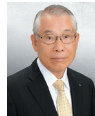
Representative of the Board of Directors